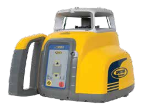
LL300S features a strong metal sunshade