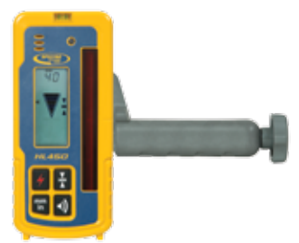
HL450 Receiver and C45 rod clamp included